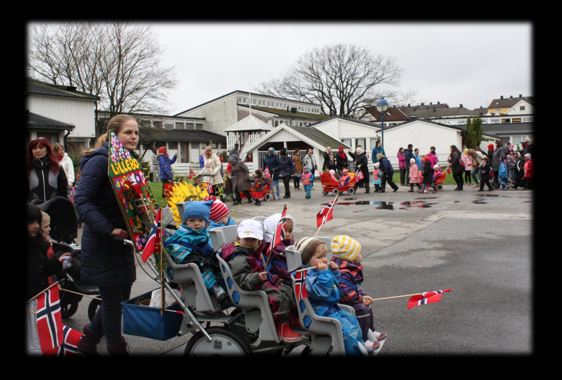
17th of May Parade